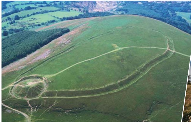
Above: Aerial (with permission of RCAHMW) and landscape photographs showing the extent of the tumulus.