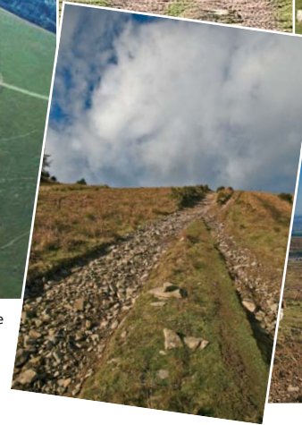
Photos on the right show the problems caused by the continued use of motor vehicles on the slopes of Twmbarlwm.