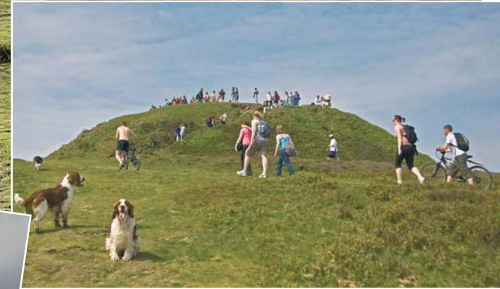
Above - CTS promoted the tradition of walking the Tump on Good Friday - it has proved very popular.